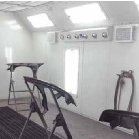
GFS Performer downdraft booth with horizontal modules

By turning on AdvanceCure, you can see the air becomes 'mixed up', and the heat is distributed evenly over the entire vehicle.