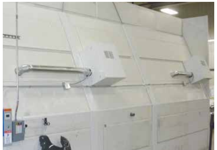
External view of module remote motors