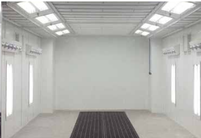
GFS Ultra downdraft booth with horizontal modules