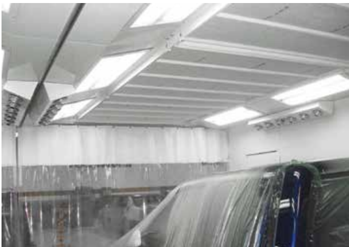
Drive-thru prep station with four horizontal modules