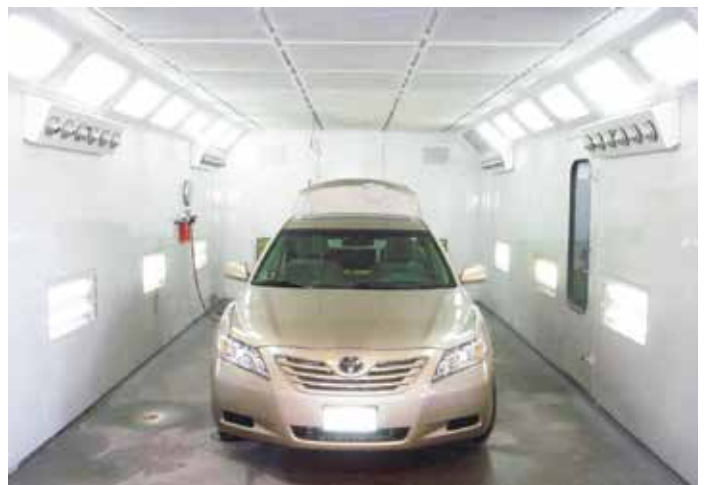
Downdraft booth with four horizontal modules