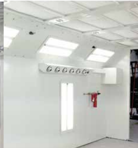
GFS Ultra Plus 1 downdraft booth with corner modules with lights